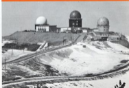
The winter winds of Wyoming howl across lonely Warren Peak.