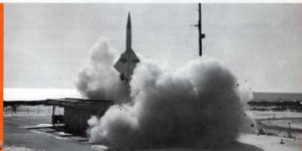
B model on the rise

Sleep well tonight, because ADC is awake! ★