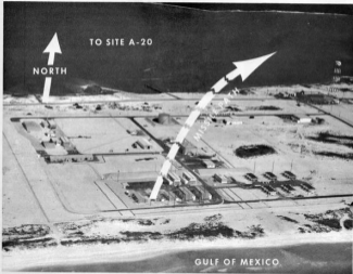
Bomber testing facilities, Santa Rosa Island, Florida

24 hours per day, seven days a week—forever! (Just ask an alert troop.)