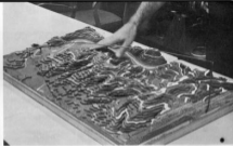
Path of flight is colorized to the terrain, becomes part of the detailed investigation.