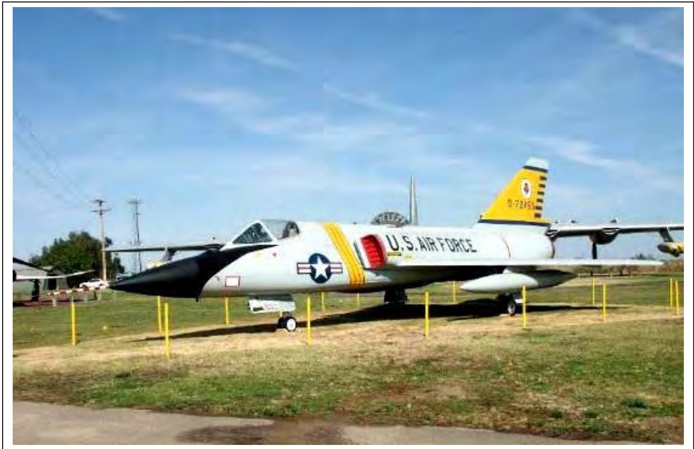
F-106 # 57-2456 was dedicated by the 456 th FIS at Castle Air Museum in Atwater, CA on May 31, 2003