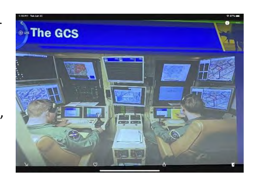
Drone operations tour was interesting!

drone squadron operations area. They still require quite a bit of ground support of the usual crew chiefs, avionics, hydraulics, security and of course flight operators (used to be pilots)!