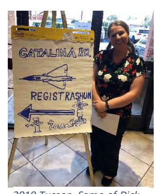
2019 Tucson. Some of Dick Stultz art work keeping our level of humor up!