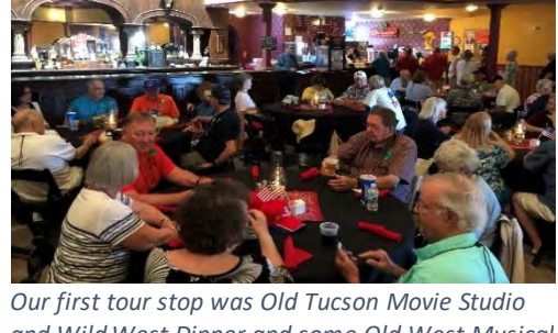
Our first tour stop was Old Tucson Movie Studio and Wild West Dinner and some Old West Musical Entertainment. They had an outstanding wild west museum, humming bird sanctuary and a western art gallery

The Pima County Air Museum and Boneyard Tours were outstanding. The F-106 (003) at Pima was in sad shape, but they said they were going to restore it in the near future. At the Davis Monthan Boneyard we were able to gather around F-106 (130), touch it fondly, tell stories around it and take