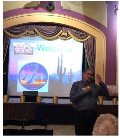
"Injun Joe" was our perfect host at "Old Tucson"

The Tucson City Visitors Bureau (CVB) was exceptionally good to us. They paid for both