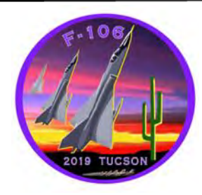
2019 Reunion: Tucson, AZ, April 3-6, Sheraton Hotel

(link to 2019 itinerary) (link to 2019 Attendees)