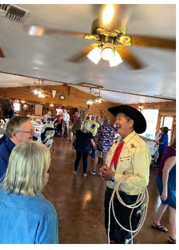
Rio Cibolo Ranch night.

We also had a fun night at the Rio Cibolo Ranch. BBQ food was good and we were entertained by a Cowboy roper who was a comedian and did some fantastic rope tricks.