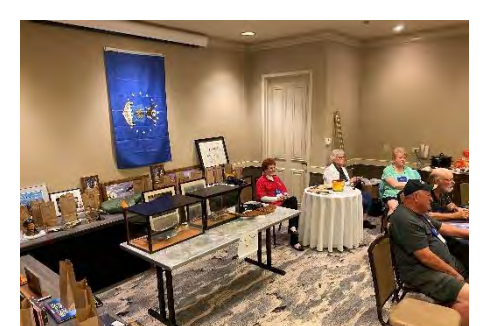
A great number of raffle donations once again!