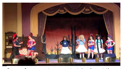
Some of our own troops entertained us at the Grand Palace Theater by dancing along with the showgirls.

many photos. It also was in very sad shape.