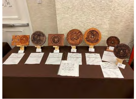
Jim Granfor hand built 15 clocks & articles