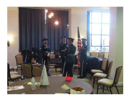
Lackland AFB Color Guard preparing for entry.

Jim Granfor continued the tradition of Jim Gier by hand building wood clocks and other wooden articles for our raffles.