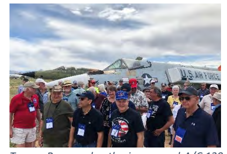
Tucson Boneyard gathering around A/C 130

The Pima County Air Museum and Boneyard Tours were outstanding. The F-106 (003) at Pima was in sad shape, but they said they were going to restore it in the near future. At the Davis Monthan Boneyard we were able to gather around F-106 (130), touch it fondly, tell stories around it and take