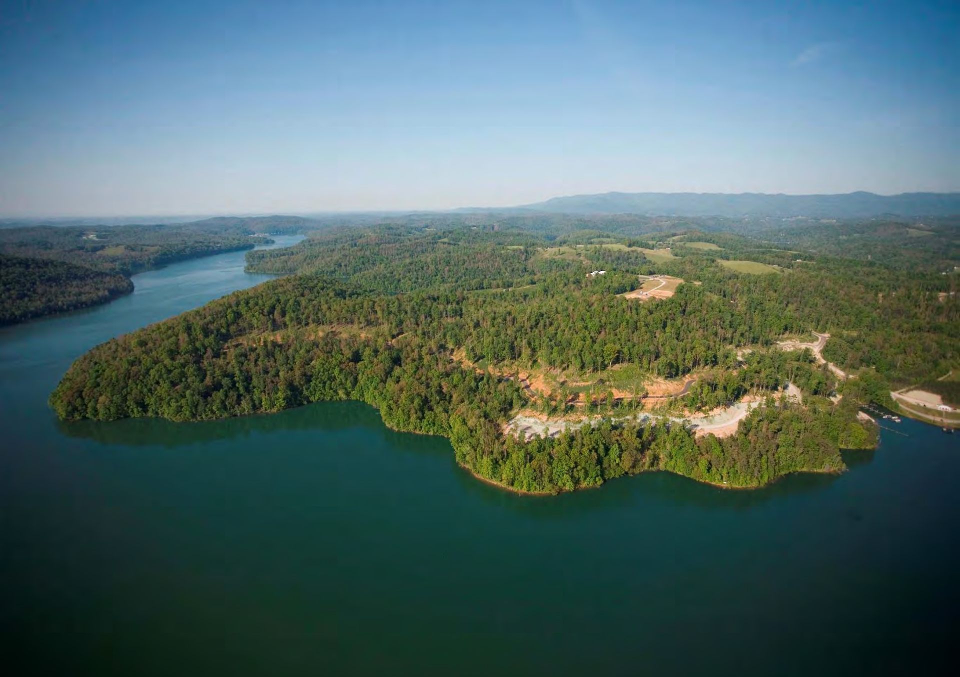
The Villages at Norris Lake North Of Knoxville, TN