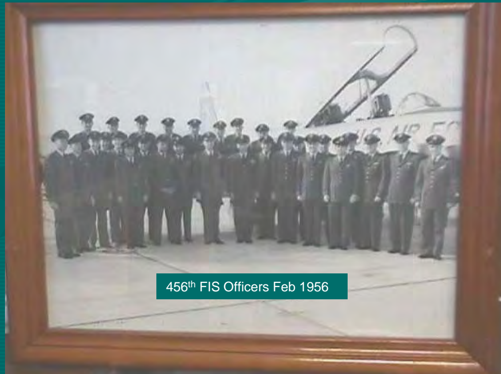
456 th FIS Officers Feb 1956