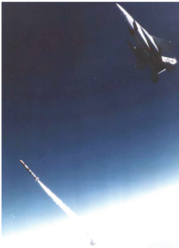
Left: The Air-launched Antisatellite missile is released from its F-15 launching aircraft and its motor is ignited. At a certain point in its trajectory, the missile released a miniature homing vehicle which destroyed the satellite by impact. Below: A cutaway view of the ASAT's miniature homing vehicle. The rockets were mounted in an outer ring around the vehicle, and the infrared seeker assembly was in the center.

Project Spike did not enter the development stage, but its technology and design provided the basis for a later antisatellite development program known as the Air-launched ASAT, which SAMSO began to develop in 1976. 53 Like Project Spike, the Air-launched ASAT employed a miniature homing vehicle propelled into space by an air-launched two-stage missile, although in this case the missile was released from an F-15 fighter. The miniature vehicle used a longwave infrared sensor to acquire its target, steered toward the target by selectively firing small rocket motors, and destroyed the target by force of impact. The system achieved a high degree of technological success. Its first free-flight test on 21 January 1984 was successful, although its second test on 2 November 1984 was not. 54 Finally, on 13 September 1985, the ASAT successfully carried out its only flight test against an orbiting satellite, 55 which it destroyed by impact. Despite some further successful testing, the Air-launched ASAT program was terminated by the Air Force on 14 March 1988 because of Congressional restrictions against testing and budgetary constraints.