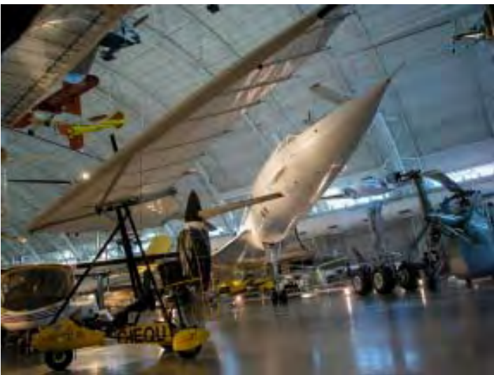
The Concorde Mach 2.0