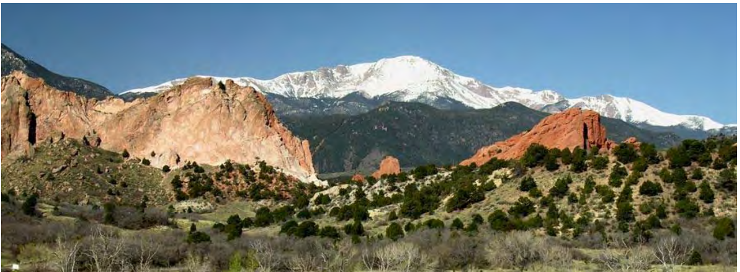
God's Gate View of Pike's Peak

See you at Colorado Springs June 3-4-5-6, 2010 at the next 456th FIS Reunion