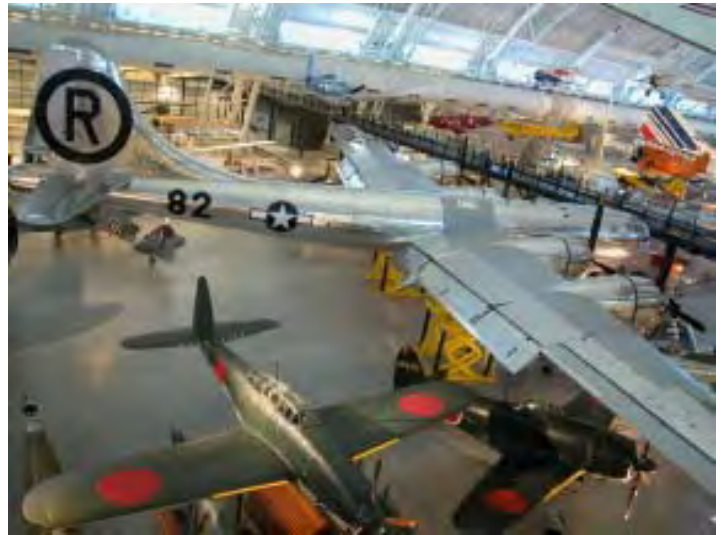
The Enola Gay