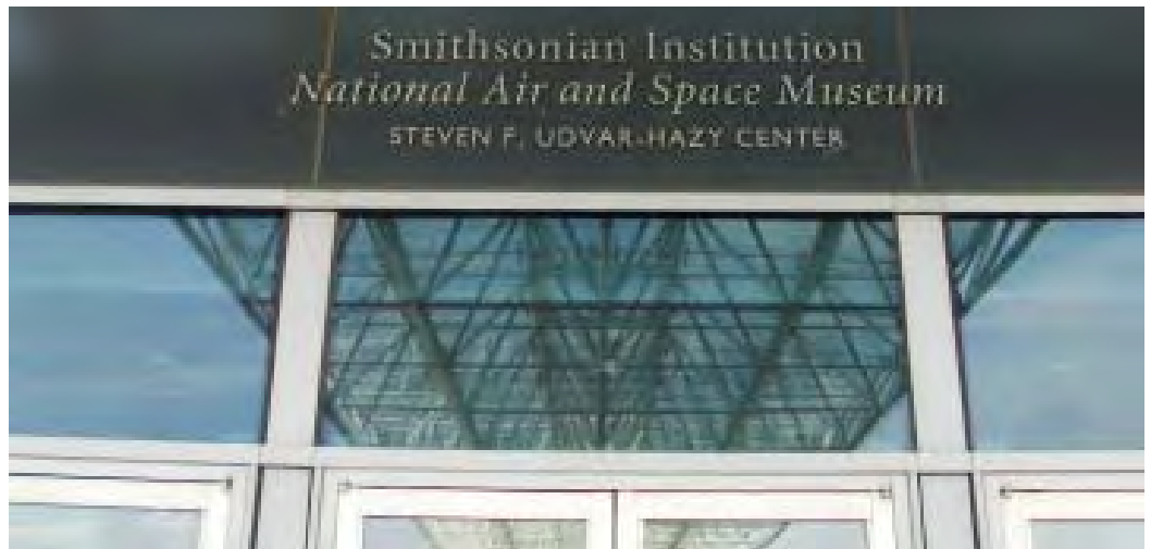
next stop: Udvar-Hazy Center