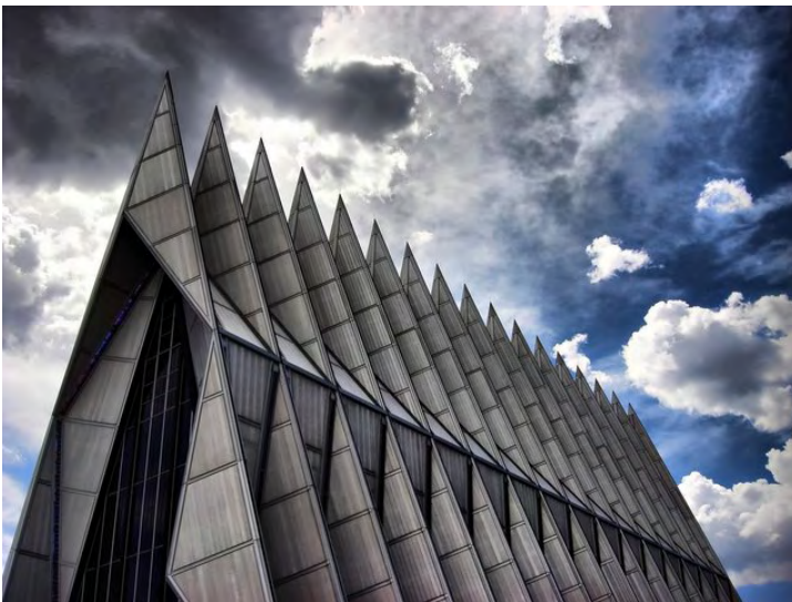
Air Force Academy Chapel

http://www.petemuseum.org/CityHangarCeremonyArea.html