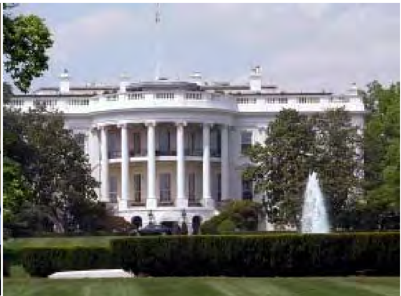
...Got us into the Whitehouse for a tour