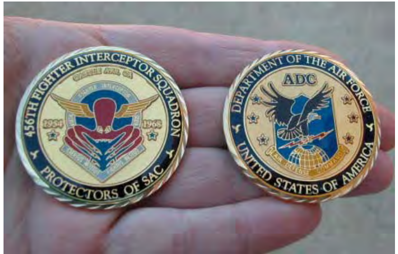
456th Challenge Coin—Pat has 32 left—$13 each includes postage