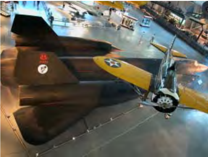
Mach 3.2 versus Mach 0.32