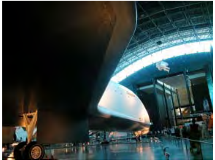
Space Shuttle Enterprise