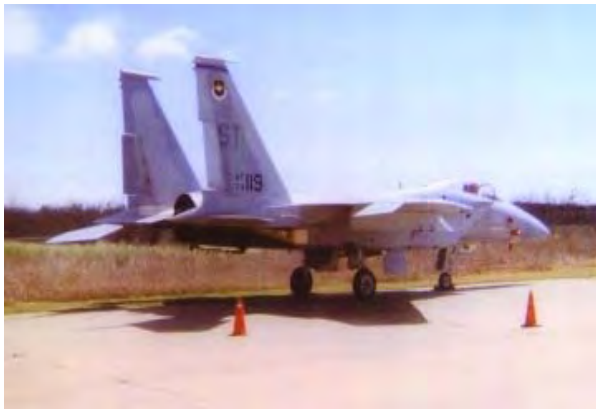
CAM F-15 sits in storage at Shepard AFB in Wichita Falls, TX